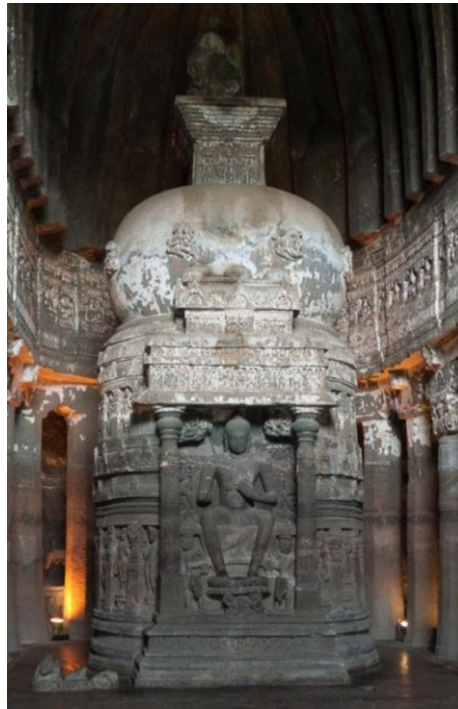
Figure 1 – The correlation between stupa and Buddha image, Ajanta Cave