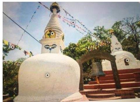
Figure 3 – Tibet Stupa Design